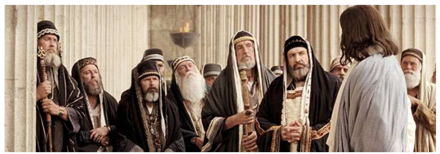
The Eighteenth Sunday after Pentecost